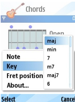
Abbildung 4: Select key

The key of a chord can either be selected with the Options menu or cycled with the navigation key (left or right).