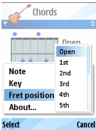
Abbildung 5: Select fret

The position of the first fret for the chord can be 1 to 13 or open. Open chords contain open strings while chords from the 1 st to the 13 th fret usually don't.