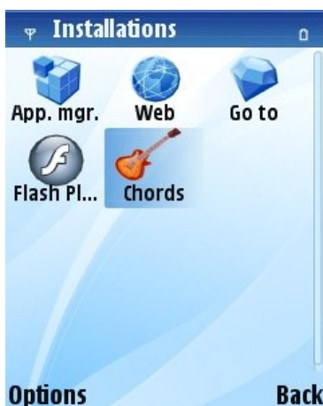
Abbildung 1: Chords icon in the application launcher

Chords for S60 3 rd edition can be started like any other application on the phone by selecting the application icon in the menu of the phone and pressing the action key or select Options->Open .